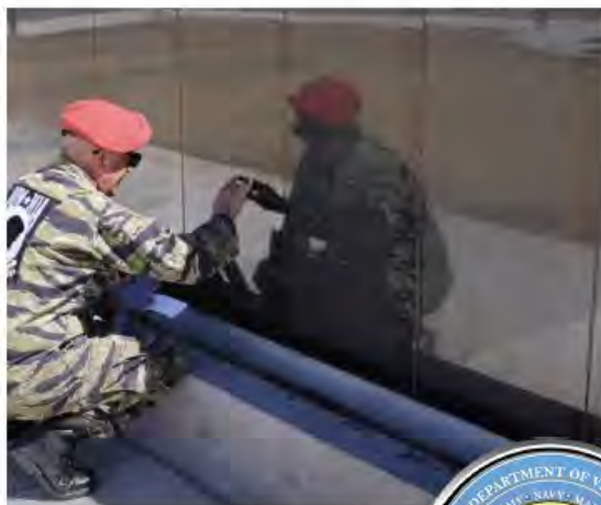
The half-scale replica of the Vietnam Memorial Wall