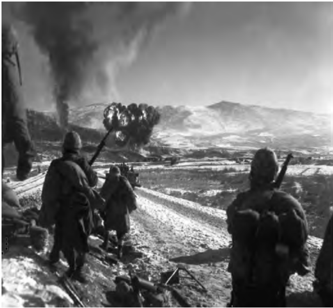
Troops advancing through snow at the Battle of Chosin Reservoir.

Sunday, July 27th, marks National Korean War Veterans Armistice Day—a day of remembrance and deep gratitude for the brave American service members who served during the Korean War. This year marks the 72nd anniversary of the armistice signing that ended open hostilities on the Korean Peninsula.