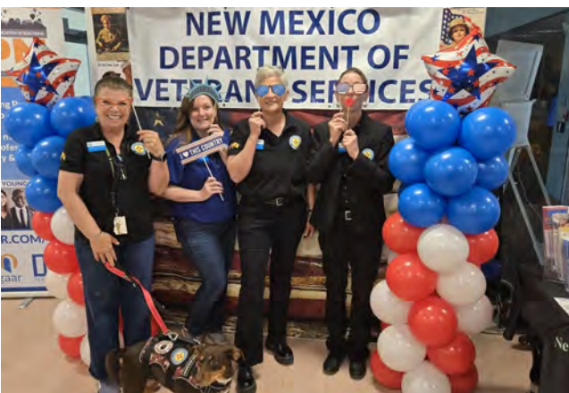
Photo: (left) Conference attendees creating friendships and connection (lower right) NMDVS Staff celebrating Women Veteran Day at the conference.