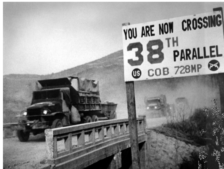
United Nations forces withdraw from North Korean capital, Pyongyang, recrossing 38th parallel.

On this day, the New Mexico Department of Veterans' Services (NMDVS) urges all New Mexicans to pause and reflect on the courage, service, and sacrifice of those who fought in Korea. We honor the fallen, remember the missing, and recognize the thousands of Veterans who came home forever changed by war. Their dedication to freedom and democracy must never be forgotten.