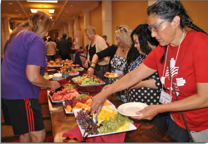
A continental breakfast (pictured, during check-in) and a plated enchilada lunch were provided by the hotel.

Representatives from the New Mexico VA Health Care System talked about a $1.5 million VA grant which will greatly expand its women veterans' program, other patient services, and LGBTQ+ care and support.