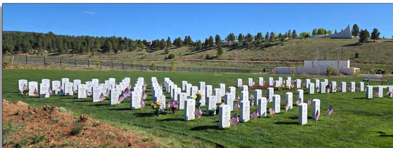
(Above/center photo) Though Memorial Day is dedicated to honoring service member who've lost their lives while in service, the DVS staff at the state veterans' cemeteries in Angel Fire (above photo), For Stanton, and Gallup (two photos below), lowered the facility's flags to half-staff, and placed small American flags at each headstone.