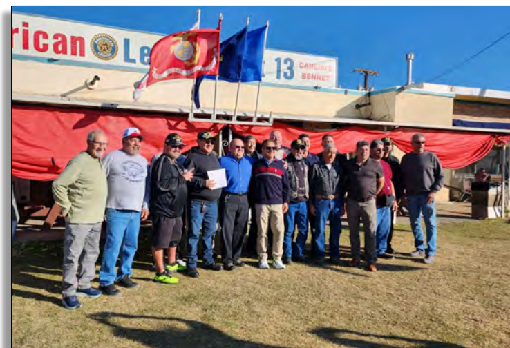
LEFT PHOTO: Members of the New Mexico Army National Guard's 20th Signal Operations Company held a reunion on Veterans day at American Legion Post 13