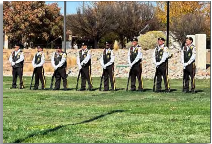
RIGHT PHOTO: The American Legion Post 13 Honor Guard from Albuquerque had the honor of rendering the rifle volley towards the end of the ceremony.