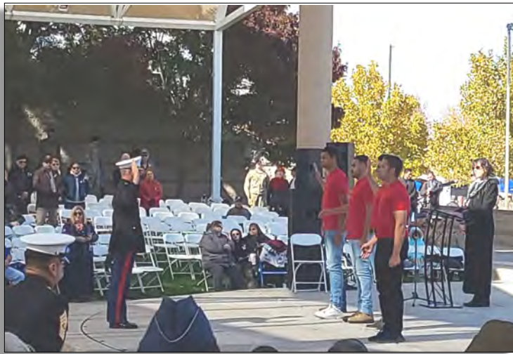
LEFT PHOTO: One of the highlights of the Albuquerque Veterans Day Ceremony was the swearing in of six Marine Corps recruits.