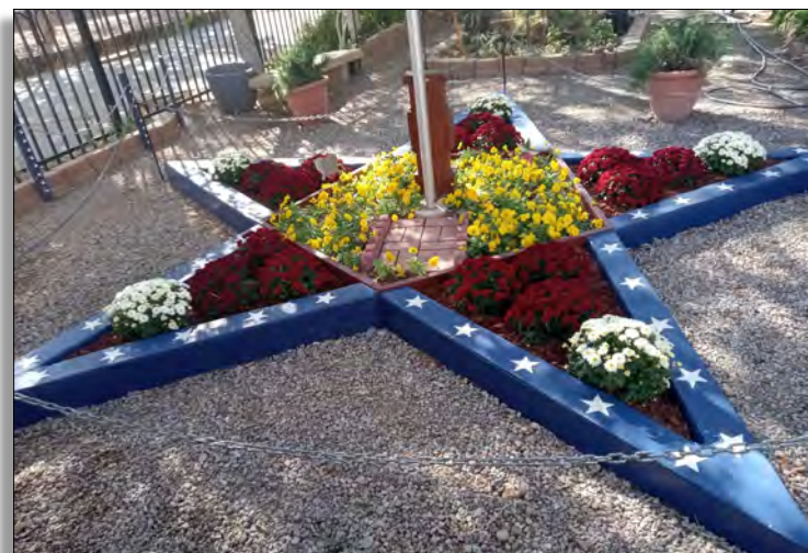
RIGHT PHOTO: The garden area at Barelas Senior Center was once again awashed in patriotism on Veterans Day, courtesy of the center's lead gardener, Patrick Turrieta—a Desert Storm/Desert Shield U.S. Navy veteran. This memorial features 50 hand-cut white ceramic stars set in a cement blue painted star representing all 50 states. Lots of live red and white chrysanthemums filled out the beautiful display.