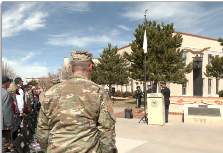
A symbolic white flag of surrender is raised at the Bataan Remembrance Day ceremony on April 8 in Santa Fe.