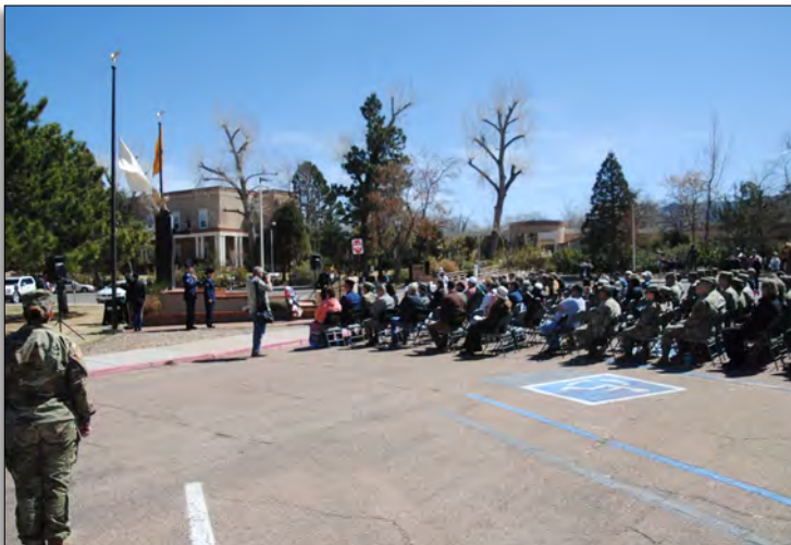
(last year's Bataan Remembrance Day Ceremony)