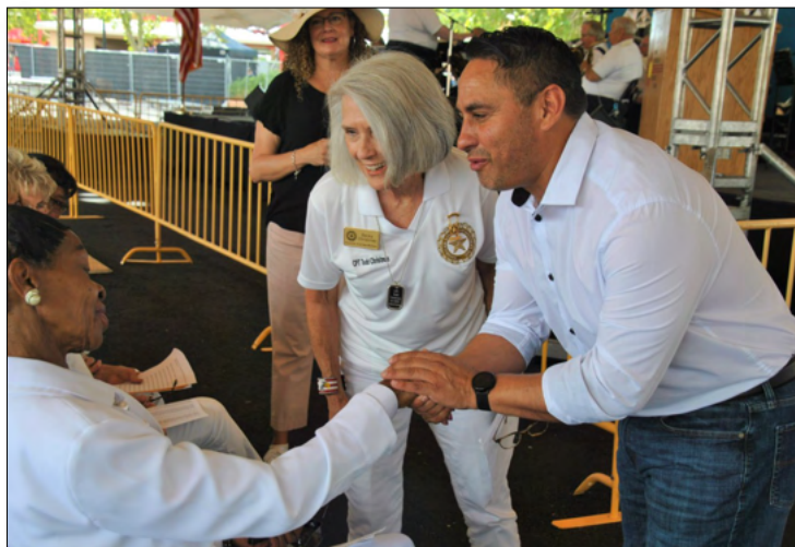
New Mexico Lt. Governor Howie Morales greets members of the New Mexico Gold Star Mothers prior to the 11 a.m. ceremony on Military & Veterans Day at the State Fair.

DVS has produced a short video montage of pictures from the day’s events.