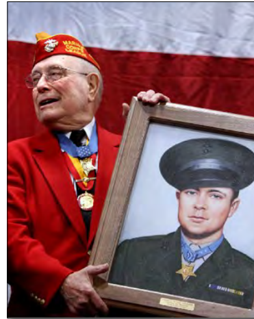
Hershel “Woody” Williams (1923-2022)

Mr. Williams was our nation’s last surviving World War II Medal of Honor Recipient. He served with the 1st Battalion, 21st Marines, and was awarded the Medal of Honor, our nation’s highest combat award, by President Harry S. Truman on October 5, 1945.