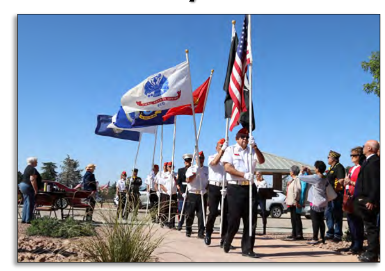
Flags were placed on the gravesites at the Fort Bayard National Cemetery in advance of the Memorial Day ceremony. Members of the Marine Corps League Gaffney-Oglesby Detachment 1328 posted the colors at the May 30 ceremony.