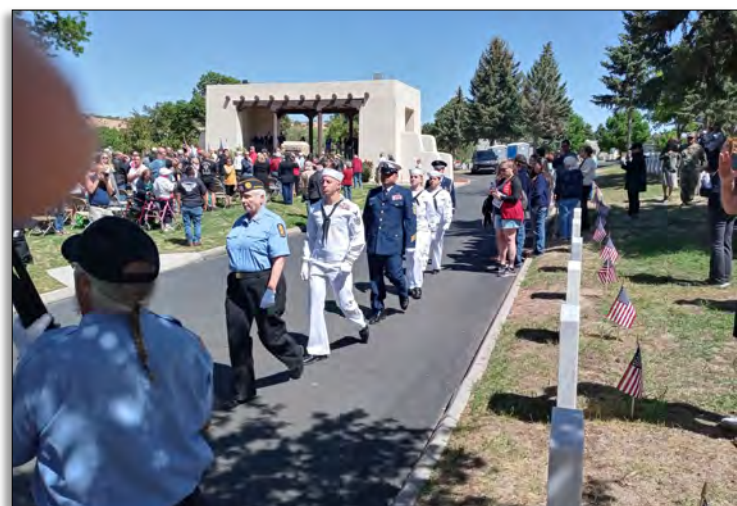
(TOP/BOTTOM 2 PHOTOS: The American Legion Post 12 Honor Guard posted the Colors and rendered a rifle volley).