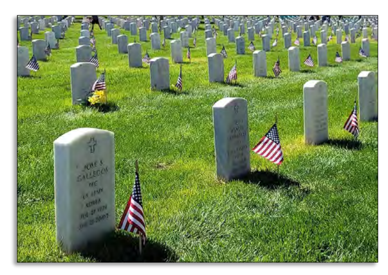
TOP LEFT & RIGHT PHOTOS: Flags were placed by volunteers and cemetery staff at many of the cemetery's gravesites.