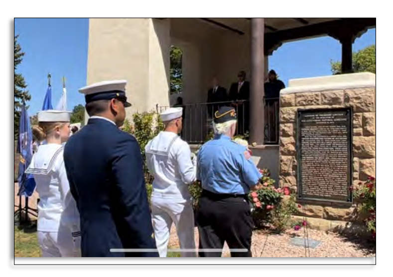
(photo courtesy: Carmela Quintana/Field Representative for U.S. Senator Ben Ray Lujan) (D-New Mexico).