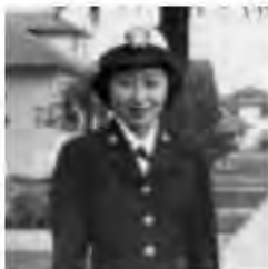
Susan Ahn Cuddy

Superintendent of the Army Nurse Corps during World War II, instrumental in advocating for the law allowing full rank for nurses, and the first woman to receive a military commission in the regular Army.