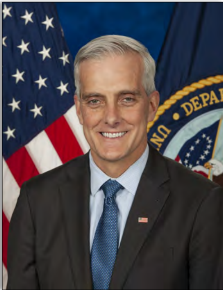
Denis McDonough VA Secretary

This bold budget request by President Biden to Congress will ensure VA is moving swiftly and smartly into the future, with much-needed monetary investments in our most successful and vital programs. To fulfill VA's sacred promise to care for our nation's veterans, families, caregivers and survivors, we must return the investment veterans have made in America through their service.