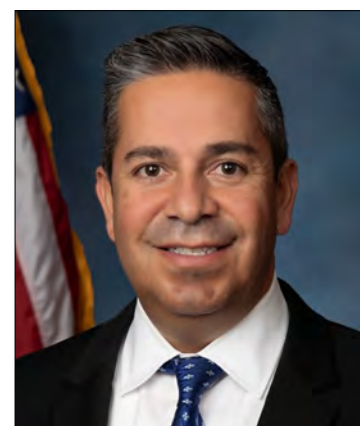
Sen. Ben Ray Lujan D-New Mexico

DVS hopes to hold similar videoconference meetings with staffs of Congresswomen Yvette Herrell, Teresa Leger Fernandez, and the replacement for Congresswoman Debra Haaland, who has been confirmed as U.S. Interior Secretary.