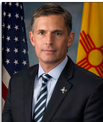
Sen. Martin Heinrich D-New Mexico