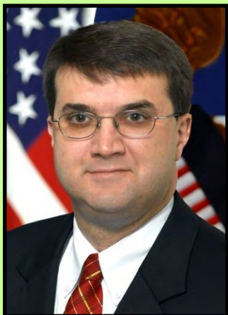
VA Secretary Robert Wilkie

For more news and benefits information from the VA, visit www.va.gov