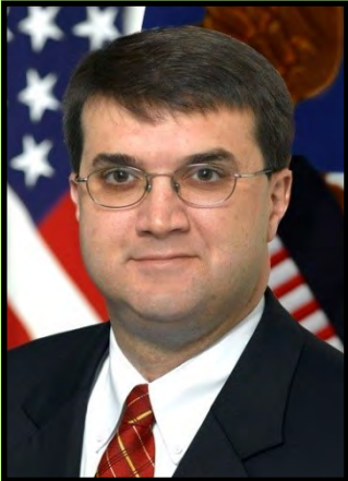
VA Secretary Robert Wilkie

For more news and benefits information from the VA, visit www.va.gov