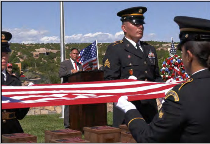
(LEFT PHOTO): Lt. Governor Howie Morales delivered the Eulogy at the September 26 Forgotten Heroes Funeral at the Santa Fe National Cemetery.