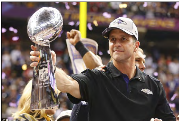
Baltimore Ravens Head Coach John Harbaugh