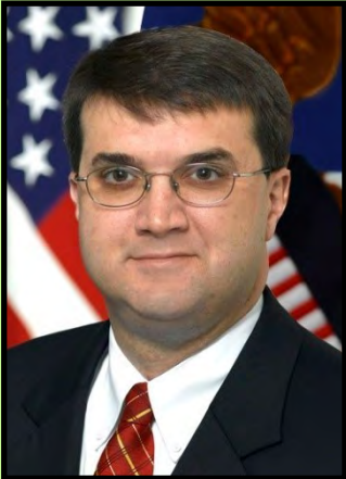
VA Secretary Robert Wilkie

For more news and benefits information from the VA, visit www.va.gov