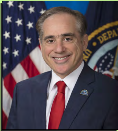
VA Secretary David Shulkin

For more news from the VA and for benefits information, visit www.va.gov