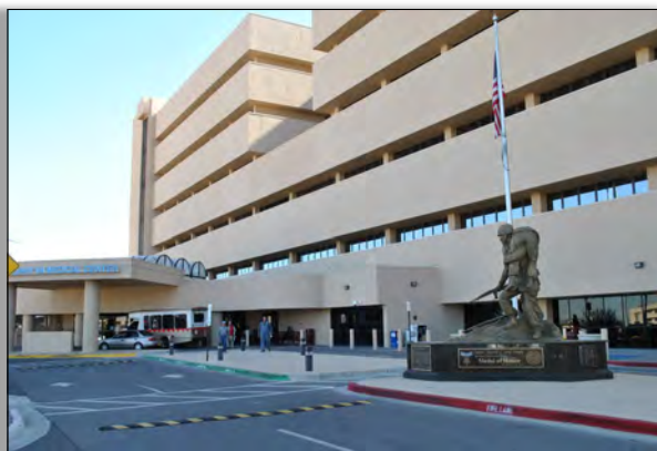
Raymond G. Murphy VA Medical Center

The New Mexico Department of Veterans Services (NMDVS) will make a state veterans benefits outreach stop on May 23 at the Albuquerque Raymond G. Murphy VA Medical Center, located at 1501 San Pedro Blvd. SE.