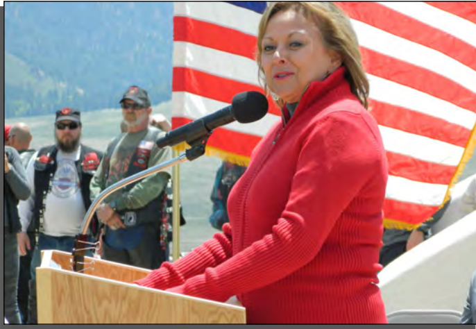
Governor Susana Martinez was the Keynote Speaker at the annual Memorial Day ceremony at the Vietnam Veterans Memorial State Park in Angel Fire. The Governor offered her deepest gratitude to the men and women who made the ultimate sacrifice on the battlefield in service to our country.