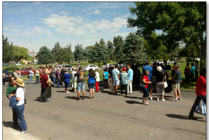
LEFT PHOTO: A flower and an American flag adorn a headstone of a fallen service member at the Mt. Calvary Cemetery in Albuquerque. Many of the headstones were similarly decorated by volunteers at the cemetery, which was the site (RIGHT PHOTO) of an annual Memorial Day ceremony.