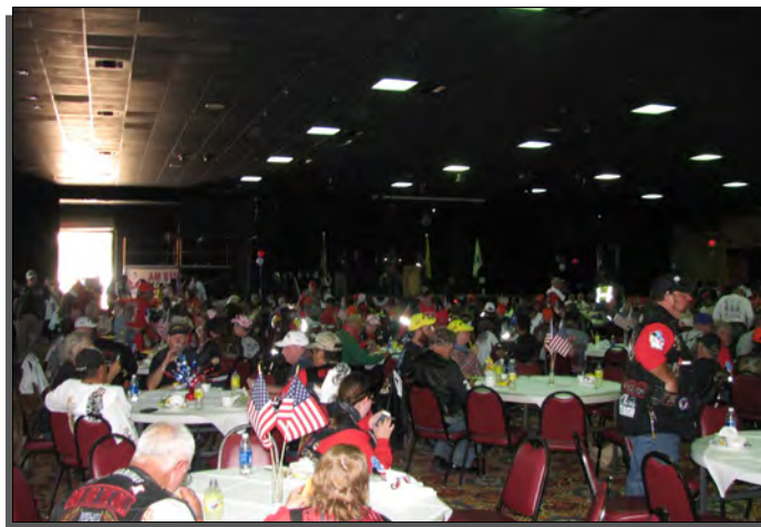
TOP LEFT/TOP RIGHT PHOTOS: Riders along the Central Route stop for free gas and lunch at the Camel Rock Casino just north of Santa Fe.