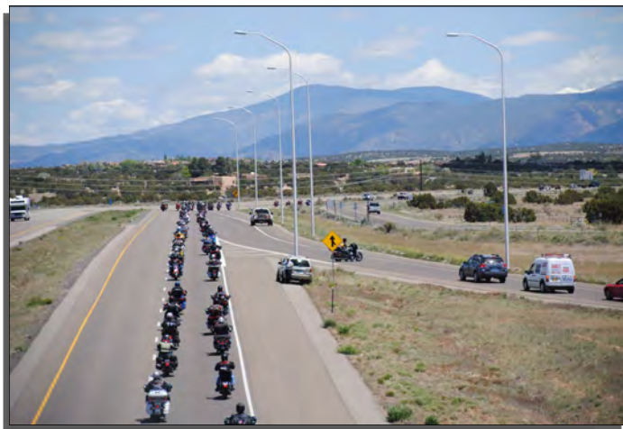
Riders on the “Central Route” arriving in the Santa Fe area along State Highway 599.

Hundreds of motorcycle riders rumbled through New Mexico from May 19-21 for the annual Run For the Wall cross-country ride to Memorial Day Weekend activities in Washington, D.C.