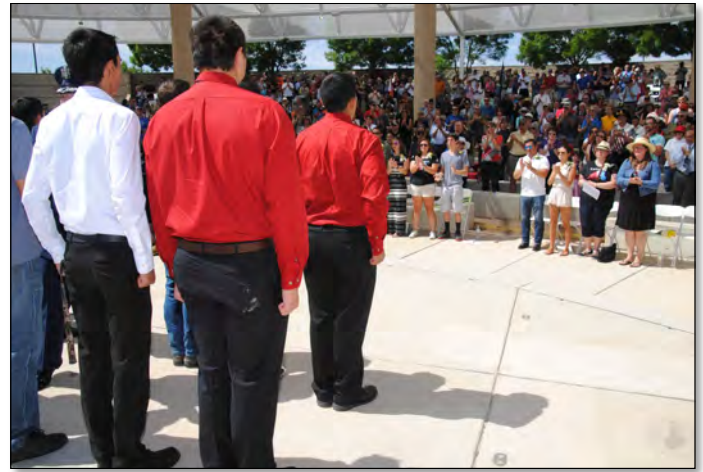
Thirteen young men and three young women were sworn into military service towards the end of the Memorial Day Ceremony in Albuquerque at the New Mexico Veterans Memorial.