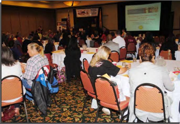
One-hundred fifty women veterans registered for the Sixth Annual New Mexico Women Veterans Conference on October 24 at the Albuquerque Marriott Pyramid Hotel.

According to the latest VA data, of the country’s 21.6 million veterans--2,035,213 million are women; roughly equivalent to the size of the entire general population of New Mexico. Of our state’s 171,528 veterans—16,743 are women.