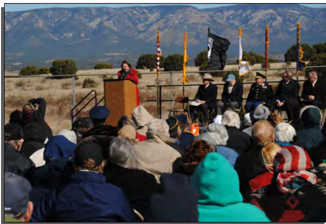
Governor Susana Martinez addresses the capacity crowd at the Veterans Day (November 11) ceremony commemorating the beginning of construction at the Ft. Stanton State Veterans Cemetery (lower-right photo).

Governor Susana Martinez dedicated the construction phase of the Ft. Stanton State Veterans Cemetery— New Mexico's first state veterans cemetery—at a special Veterans Day Ceremony at the existing Ft. Stanton Merchant Marine & Military Cemetery.