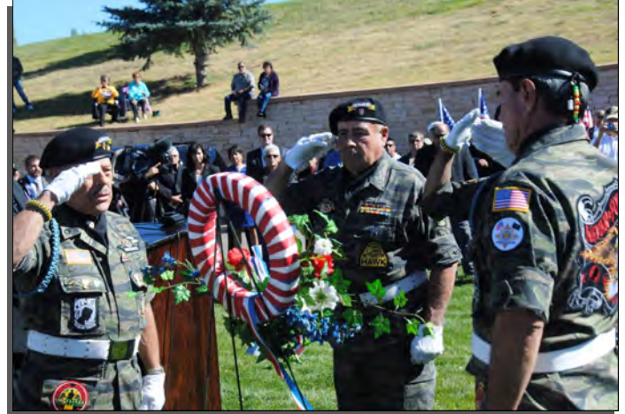
Members of the Vietnam Veterans of America/Northern New Mexico Chapter 996 salute a wreath presented by the group during the gravesite service.