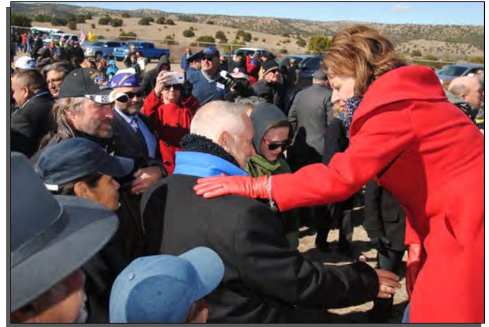
RIGHT PHOTO: Governor Martinez greets the crowd after the ceremony.