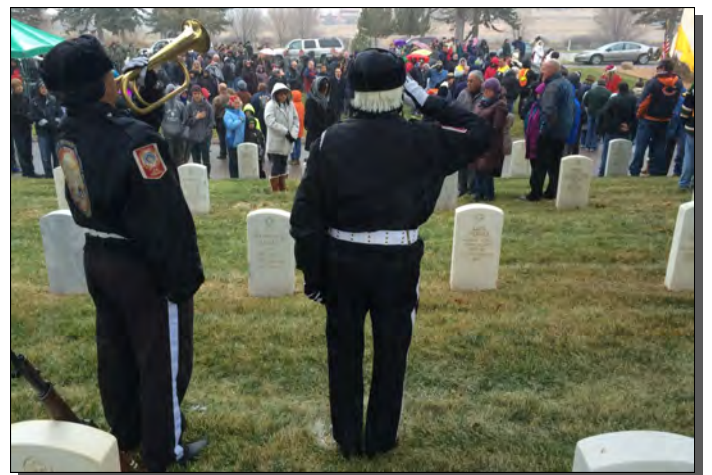
The VFW Post 2951 provided the 21-Rifle Volley and the playing of “Taps” during the December 12 “Wreaths Across America” ceremony at the Santa Fe National Cemetery.

In addition to the Santa Fe National Cemetery, Wreaths Across America ceremonies also took place at the Ft. Bayard National Cemetery, the Ft. Stanton Merchant Marine & Veterans Cemetery, the General Douglas L. McBride Roswell Veterans Cemetery...and at private cemeteries in Roswell, Carlsbad, Farmington, Gallup, Los Alamos, Lovington, and Ruidoso. For more information about the Wreaths Across America program, go to http://www.wreathsassamerica.org .